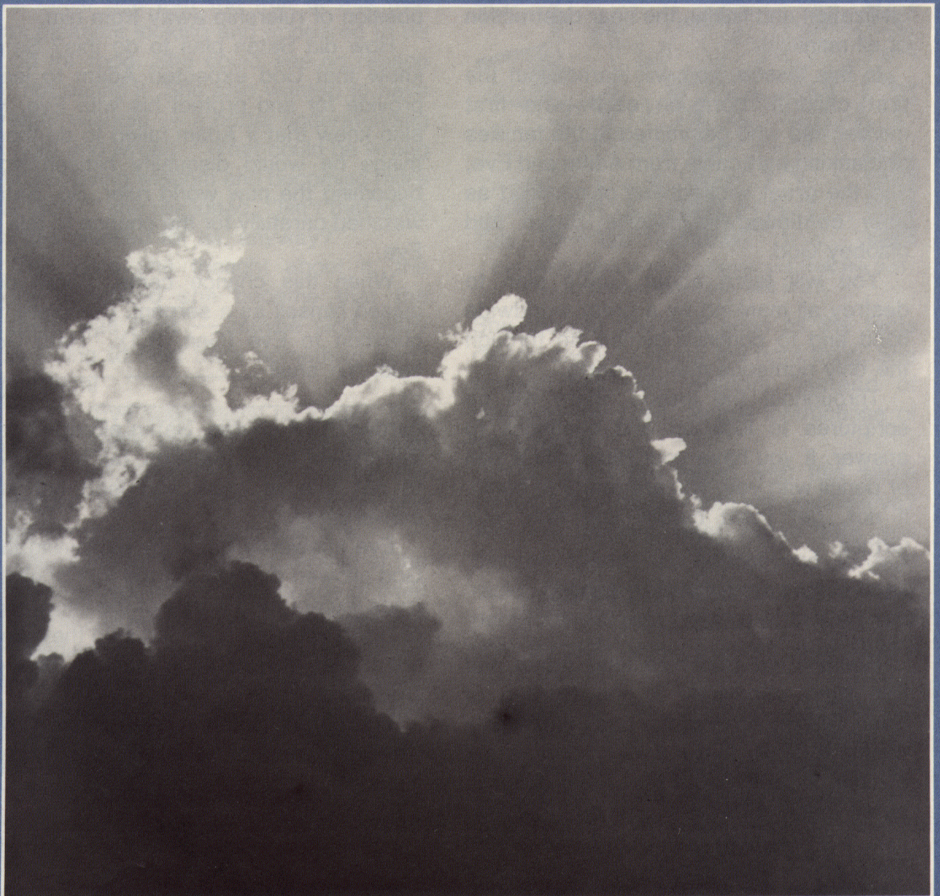
Man's History Begins